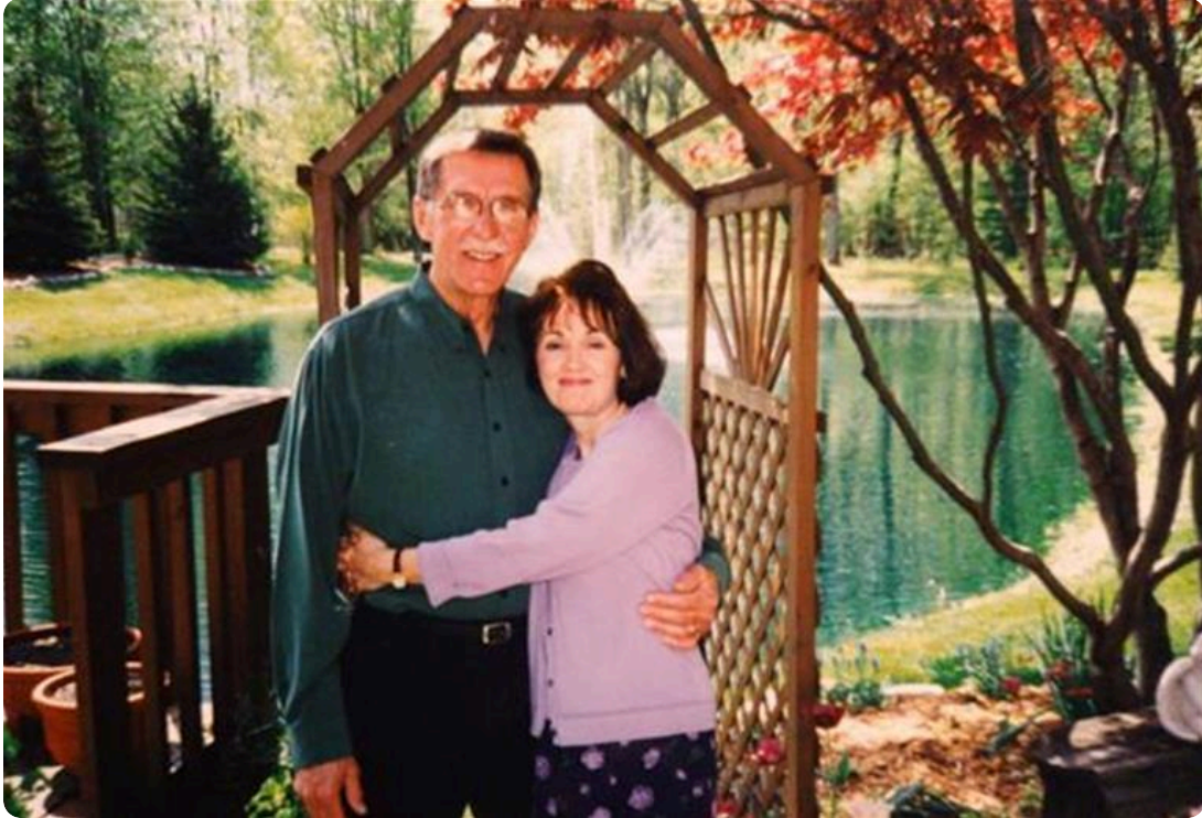
Dad & Mom